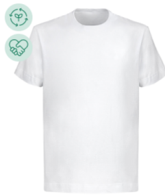
(a) Sustainable with visuals and abstract terms

T-shirt from recycled cotton Product code: 005 ● ● ● ● S M L XL 2XL 27,20 € VAT included Free delivery Buy