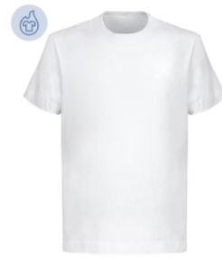
(b) Sustainable with visuals and concrete terms

T-shirt Product code: 006 ● ● ● ● S M L XL 2XL 20,90 € VAT included Free delivery Buy