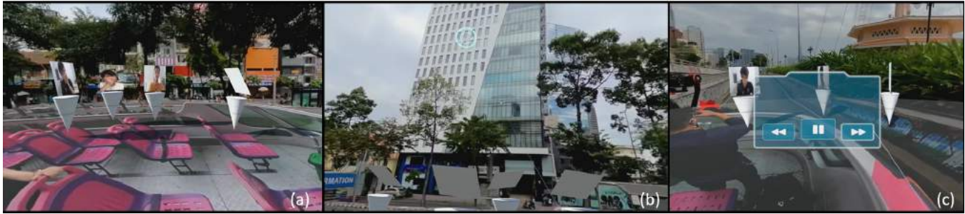
Figure 2: (a) Audience avatars in the 360 video skybox: the video stream showing the audiences’ behaviors and expressions and the avatar’s orientation conveying the audiences’ attention. (b) Holo marker pinned at a location to highlight a point of interest and audience avatars are looking at it. (c) The video control panel with 3 buttons: backward, pause, and forward

of their own face performing six expressions: neutral, concentrate, surprised, distracted, bored and laughing. These expressions were brainstormed and distilled by the research team based on the need-finding interview data. These recorded videos were displayed on audience avatars to create the impression there were audiences attending the tour guiding training session. To improve their realism, the audience avatars randomly moved around in the VR environment and some also turned towards the pointing location of the trainee user on the 360 video. Each participant had around 10 minutes to get familiar with the system. When they felt ready, they started the study where they performed a 10-minute tour guiding with a 360 travel video of the local city. The participants were given a sample script presenting about most interesting landmarks in the video 3 days prior to the study. The script was composed by the research team and the participants were told that they just needed to remember the main contents associated to certain times in the video, not word by word. To improve the sense of realism, the participants were told that some of the avatars in the VR environments were real audiences remotely joining into the session. After the tour guiding, the participants were interviewed for around 20 minutes to gather their feedback on the system.